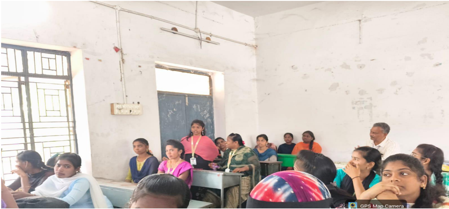
STUDENT S ARE ANSWERD REGARDS TRAFFIC RULE S