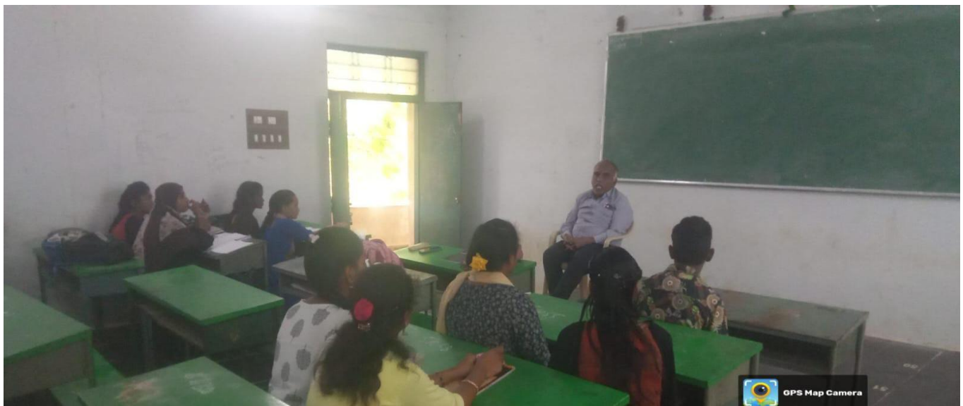
PRINCIPAL SIR WERE EXPLAINED ABOUT TRAFFIC RULE S WHILE IN BETWEEN GROUP DISCUSSION