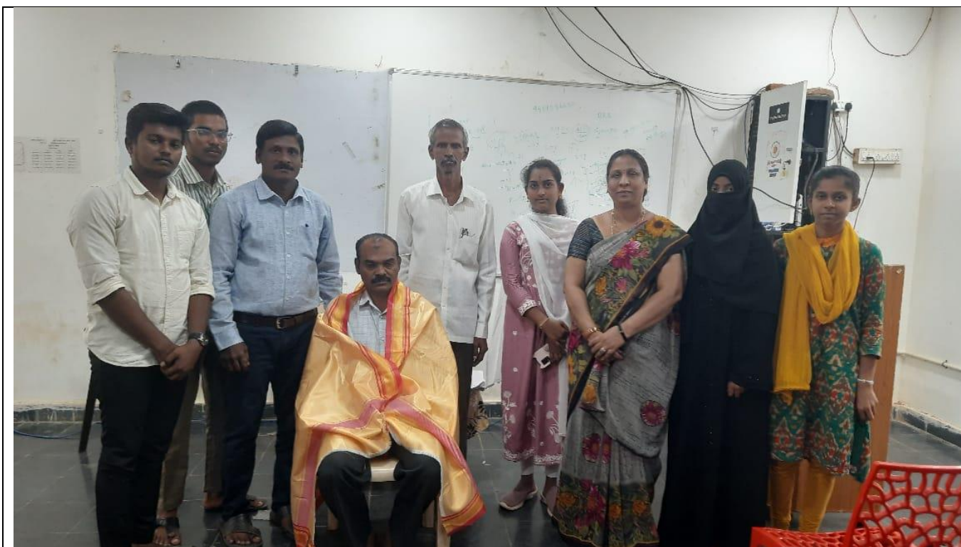
Felicitating the Guest by staff and students