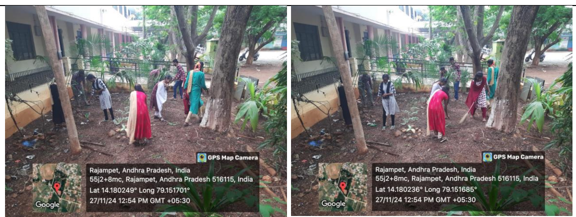
Students removing waste materials infront of Zoology Dept..