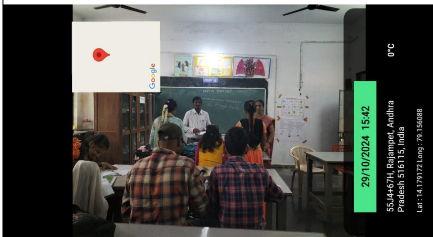
Interaction between faculty of zoology and students