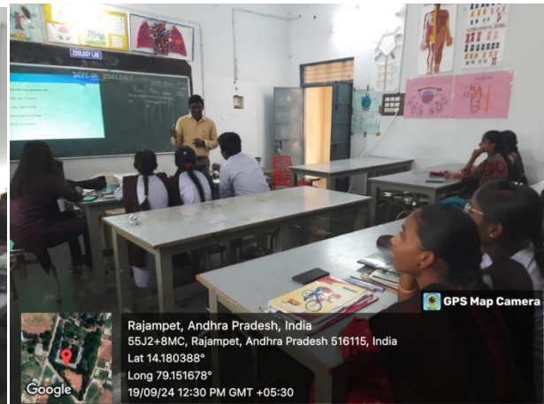
Quiz master asked questions to the students