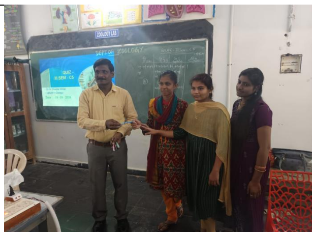
Bird group – Winners