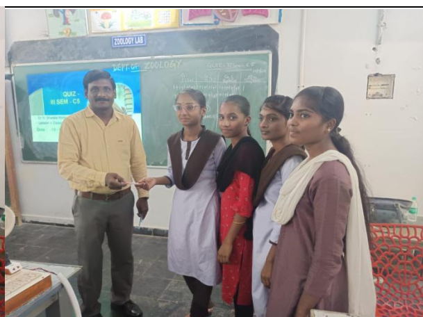
Reptelia group – Runners