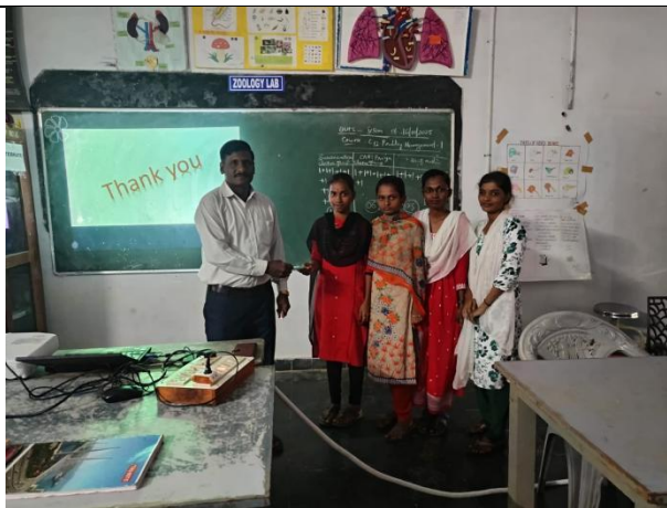
Swarnandhra chicken group – Winners