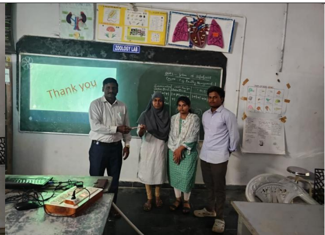
CARI Priya chicken group – Runners