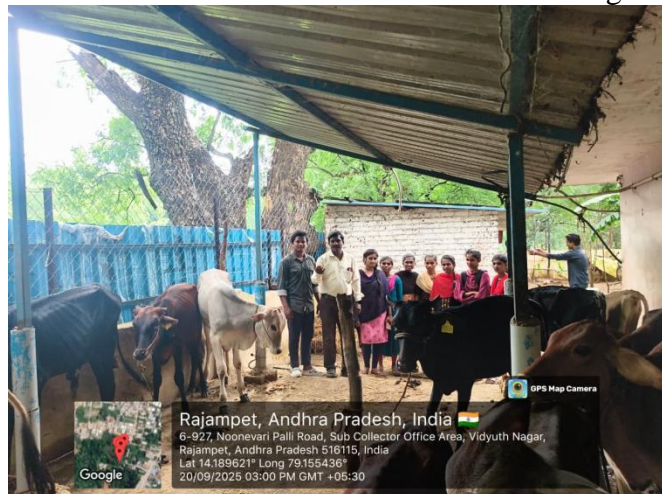
Observing different cattle species

Rajampeta, Andhra Pradesh, India 6-808, Sub Collector Office Area, Vidyuth Nagar, Rajampeta, Andhra Pradesh 516115, India Lat 14.189602° Long 79.155735° 20/09/2025 02:38 PM GMT +05:30