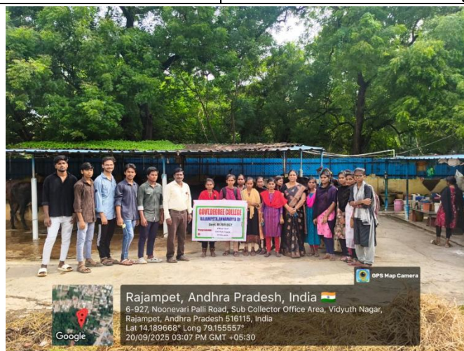
Started journey to cattle farm