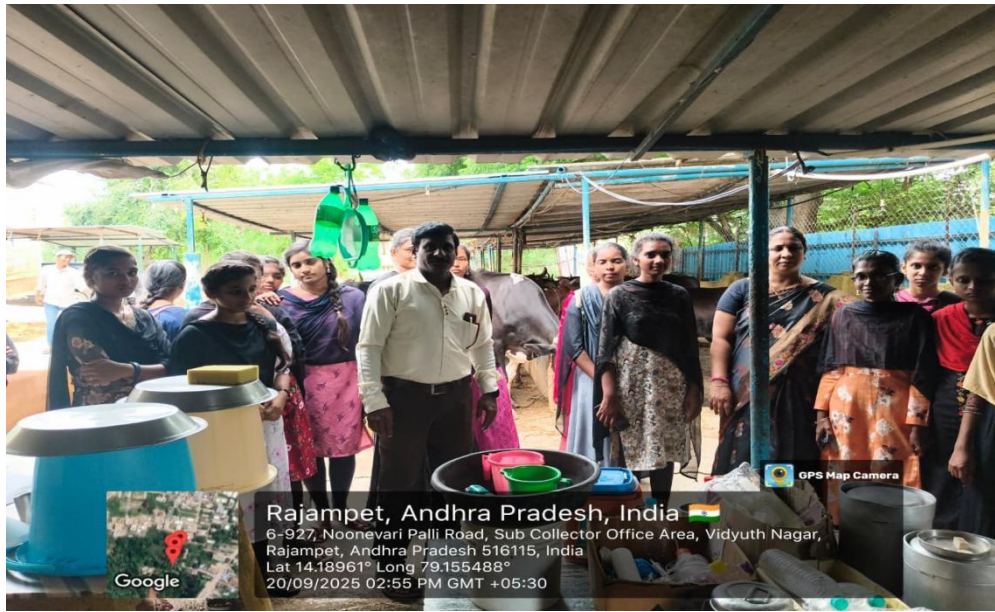
Observing milk collecting cans