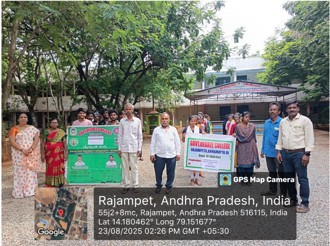
Starting journey from the college