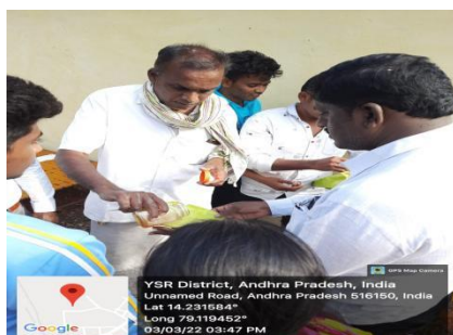
Students tasted the honey