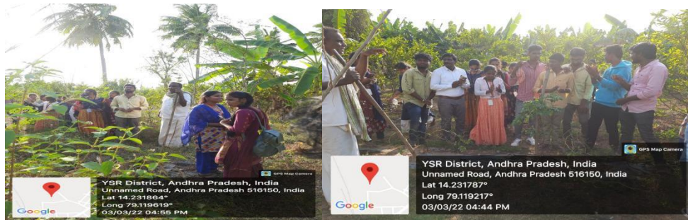
Students observed different types of plants rearing the organic farming