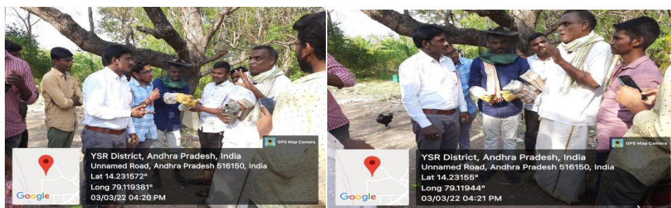
Varapasada reddy garu explained the equipment using for honey harvesting