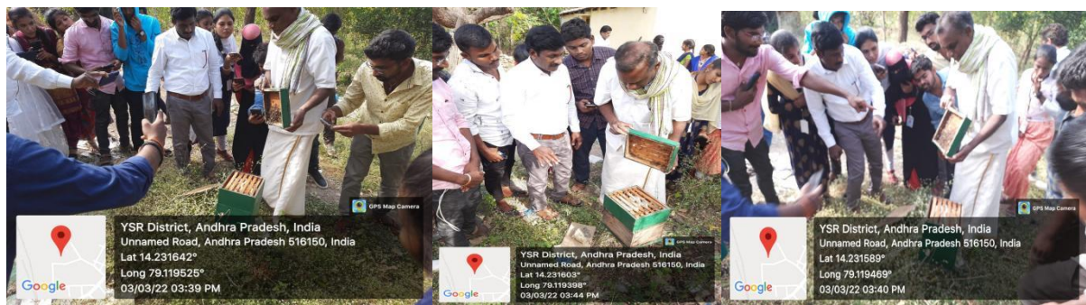
Students observed the structure of bee hive and different castes of bees