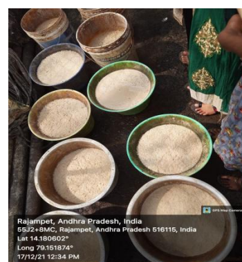
mixed feed providing to the cattle's