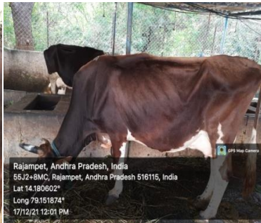
Exotic cattle - Holstein Friesian