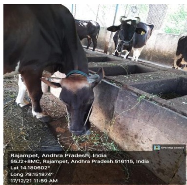
Head to Head type housing system