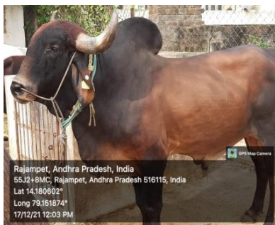
Indegenous bull (Gir).

Started journey from college to the dairy farm